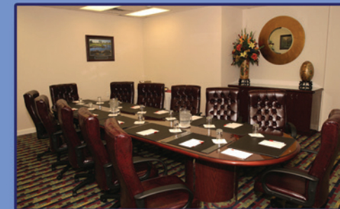
Princeton Executive Board Room

O ur experienced coordinators will assist you from beginning to end to ensure a successful meeting.